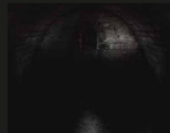
Rutger Zuydervelt, Ice Age, 2014

In everyday life, we hear thousands of sounds, but we are not used to listening to them. For Undertones , Marres has invited artists to work with city sounds for a route through Maastricht. The route introduces you to spectacular underground spaces. These natural and often dark sound chambers sharpen the hearing and provide a unique acoustic layer to the artworks. Inspired by old and new local sounds, the artworks reveal an underground acoustic mirror of the area.